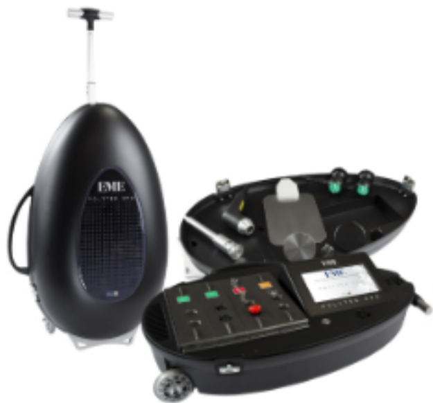
modular and combined technology